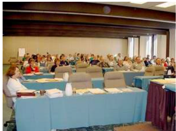
As always, Recorders hard at work!